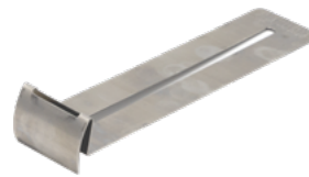
A-PED-WALL Edge Restraint