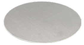
A-PED-SPREADER-170 Thickness: 2mm Diameter: 170mm